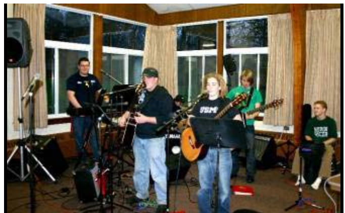
Worship is at the heart of MissionChrist, and so it was the heart of the Spring Retreat, too. A lot of the songs are written by members of MissionChrist, one of the signs of the Holy Spirit stirring up a vibrant worship life.

But then I started going to Mission Christ on Friday nights, and was subsequently convinced into going on their spring retreat. I was confused. Where was the light show? When were