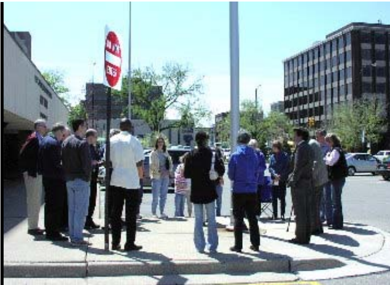
Both current and former members of The Word of God made up a significant number of the folks observing the National Day of Prayer outside the Ann Arbor City Hall at noon on May 3rd. A similar event was taking place simultaneously at the Ypsilanti Public Library.