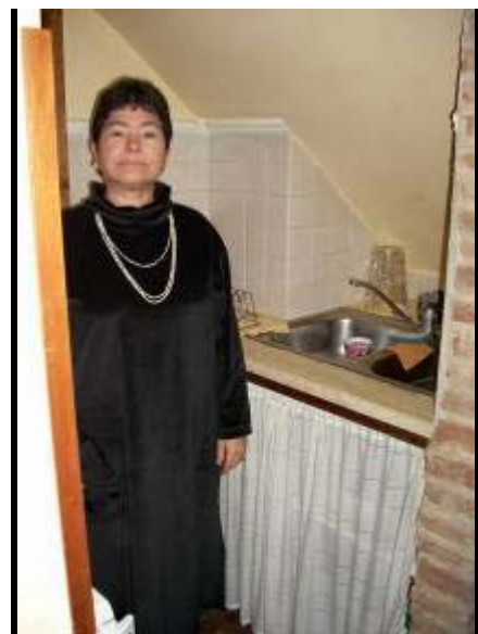
Here's the kitchen. Maybe Italians would rather go out to eat!