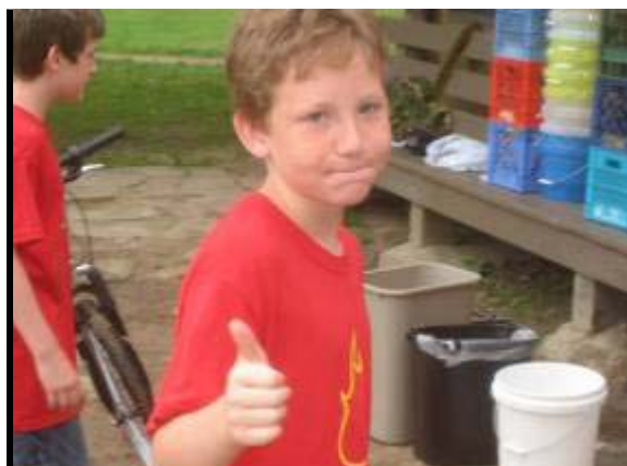
A one thumb commentary on Camp!